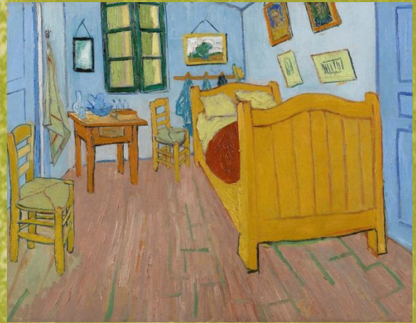
Vincent van Gogh, The Bedroom, 1888.

The Saint Louis Art Museum holds family Sundays every week in the Sculpture Hall from 1-4 p.m. They have hands-on projects for kids.